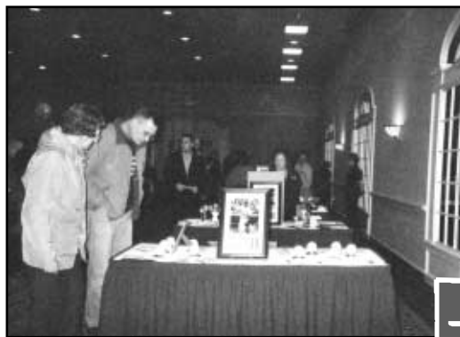
Hot Stove patrons view Silent Auction items