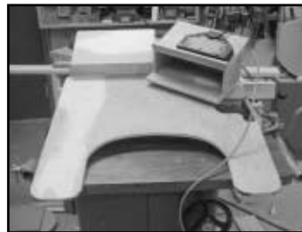
The "Indickator" was presented at the national American Occupational Therapy Association conference.