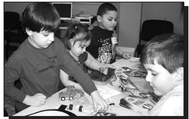
Children work on arts and crafts projects at Family Night