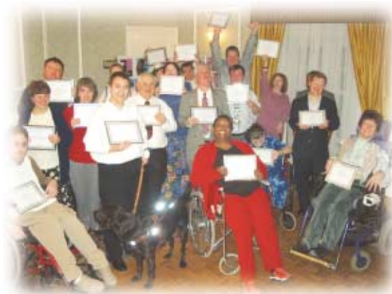
Participants in Enable's Individualized Services Program display their certificates celebrating their tenth anniversary.

celebrated ten years of service to people who previously would have been served in group living arrangements, but now live independently.