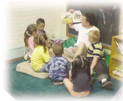
Children, staff, and parents benefit from Enable's family literacy program launched at inclusive pre-schools.

Education Services launched a family literacy program and a mentoring component.