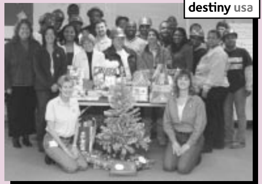
Destiny USA employees