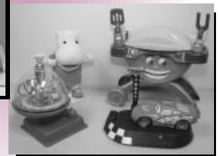
Some of the adapted toys purchased with the grant.