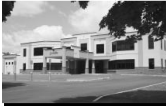
Enable Building on Court Street