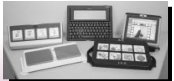
New augmentative communication devices purchased through the grant from the Allyn Foundation.

Thanks to the generous support of the Allyn Foundation, Enable was able to purchase state-of-the-art augmentative communication devices and new adapted toys for our assistive technology (AT) program. Enable's assistive technology program allows people with disabilities to have a hands-on opportunity to work with augmentative communication devices during their evaluations. By having these equipment choices available, individuals with disabilities and their families can make an informed decision about which communication device best meets their needs reducing the risk of equipment abandonment. The new switch adapted toys are appropriate for young children with very limited motor skills and provide an effective means to engage a child during their augmentative communication evaluation.