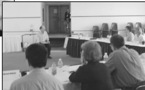
Volunteers at Retreat