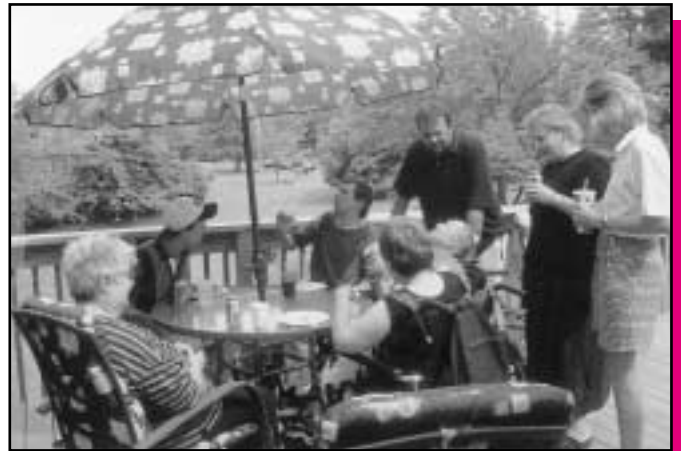
Residents of Bradbury Drive happily showed neighbors the deck during the open house.

With financial assistance from private foundations, Enable was able to open a new Computer Services component within our Assistive Technology department. A room has been set up with three workstations, each equipped with a variety of different adaptive devices and software to assist individuals with disabilities to improve their computing skills, job readiness and communication opportunities.