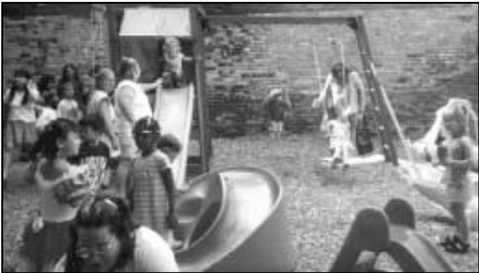
Playground at CYO, an Enable collaborative preschool site

Diagnostic, Clinical & Assistive Technology Services serves people of all ages and a wide range of disabilities. As a Diagnostic & Treatment Center licensed by the NYS Health Department, Enable collaborated with the Central New York Developmental Services Office and the Arc of Onondaga to provide therapy services at their locations, as well as at Court Street and the Nottingham. A total of 867 people were served in 2000.